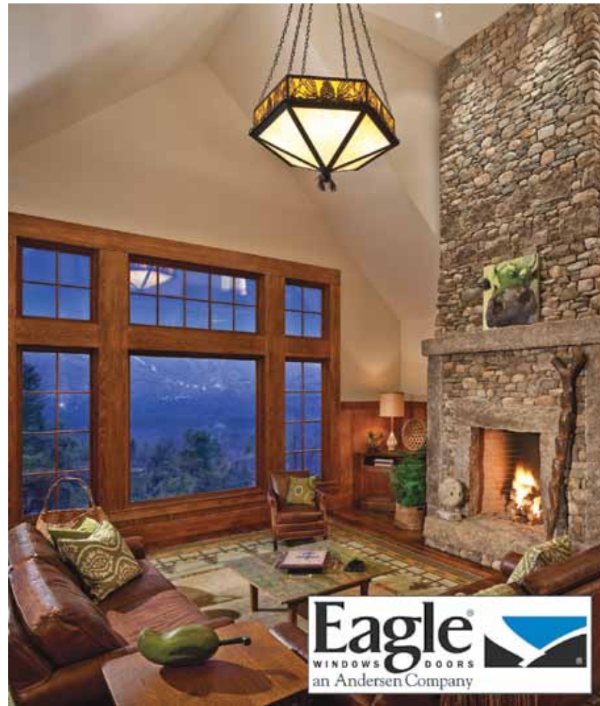
Stunning Eagle Windows perfectly frame this two-story combination great room and dining room overlooking the mountains and local ski resort.

“WHEN IT COMES TO FINDING THE RIGHT WINDOW FOR YOU AND YOUR CUSTOMERS, THE ANSWER AT HANCOCK LUMBER COMPANY IS GOING TO BE ‘YES,’ WE HAVE A GREAT WINDOW FOR THAT.” —KEVIN HANCOCK